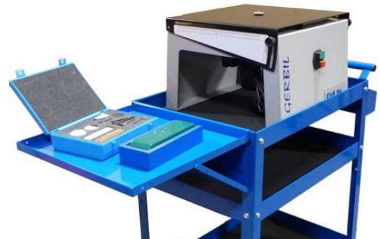
Gerbil 2030 shown with optional shelf