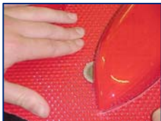
TC Abrasive Disc