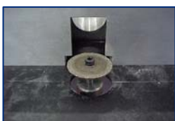
Dust Extraction Fence