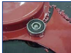
Tungsten Carbide Flange Cutter